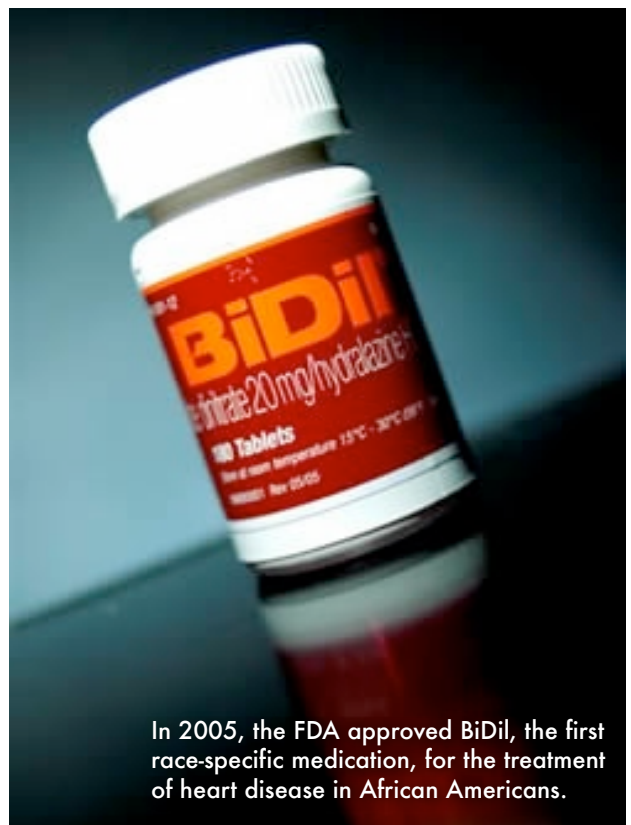
In 2005, the FDA approved BiDil, the first race-specific medication, for the treatment of heart disease in African Americans.

This project will be discussed more during class sessions and a grading rubric will be posted on the course website.